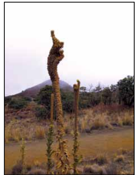
Mullein plants on the side of Mauna Kea - one is gesturing with the shaka sign.