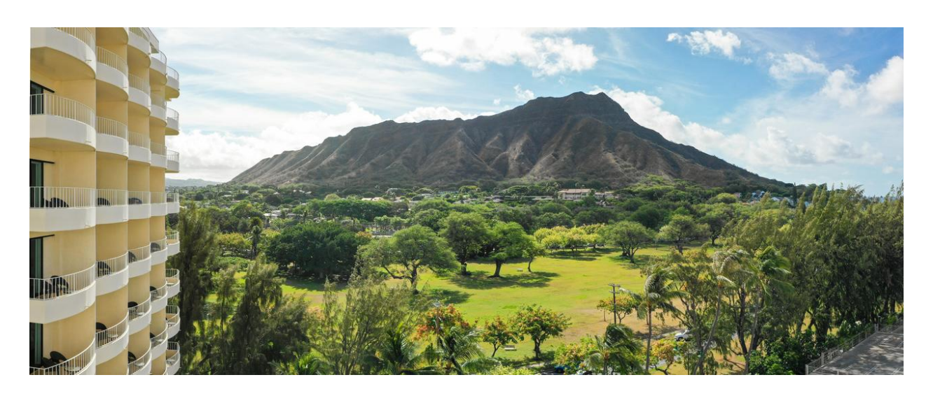
Lotus is a 100-room boutique hotel. Diamond Head Crater is next door. Beaches are 3-minute walk.