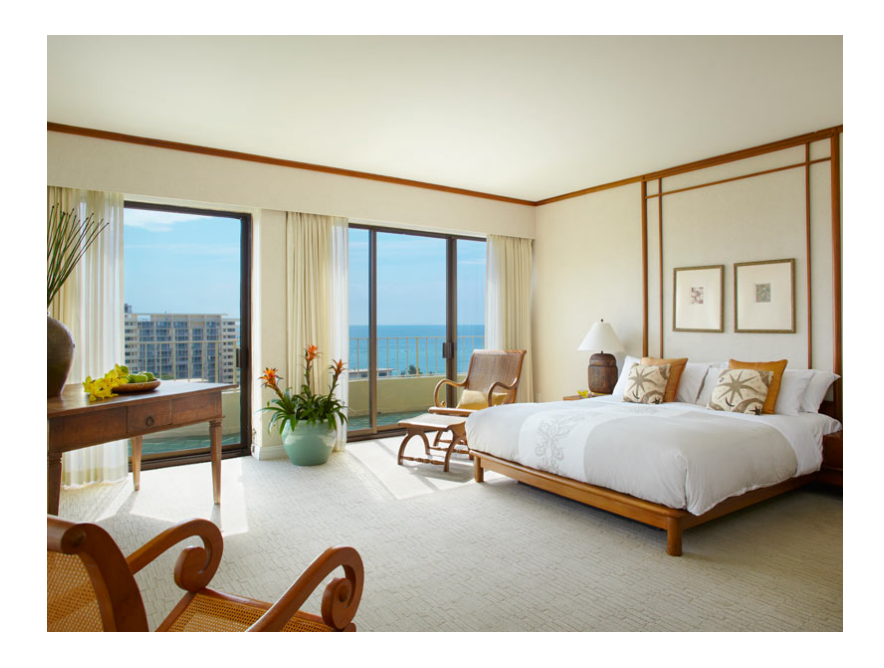
Get an oceanview room and watch the Pacific from the balcony.

Website - - <a href="https://www.lotushonoluluhotel.com/">https://www.lotushonoluluhotel.com/</a> Youtube video - - <a href="https://www.youtube.com/watch?v=JZt6vR82yhk">https://www.youtube.com/watch?v=JZt6vR82yhk</a> (skip the ads)