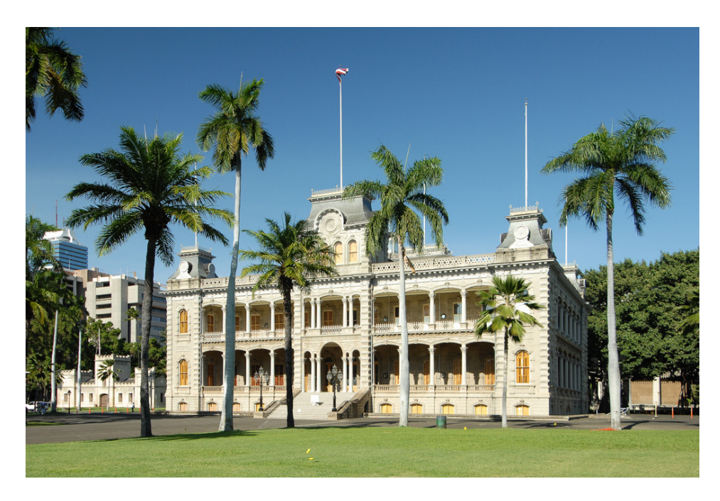
Iolani - - the only palace in the United States