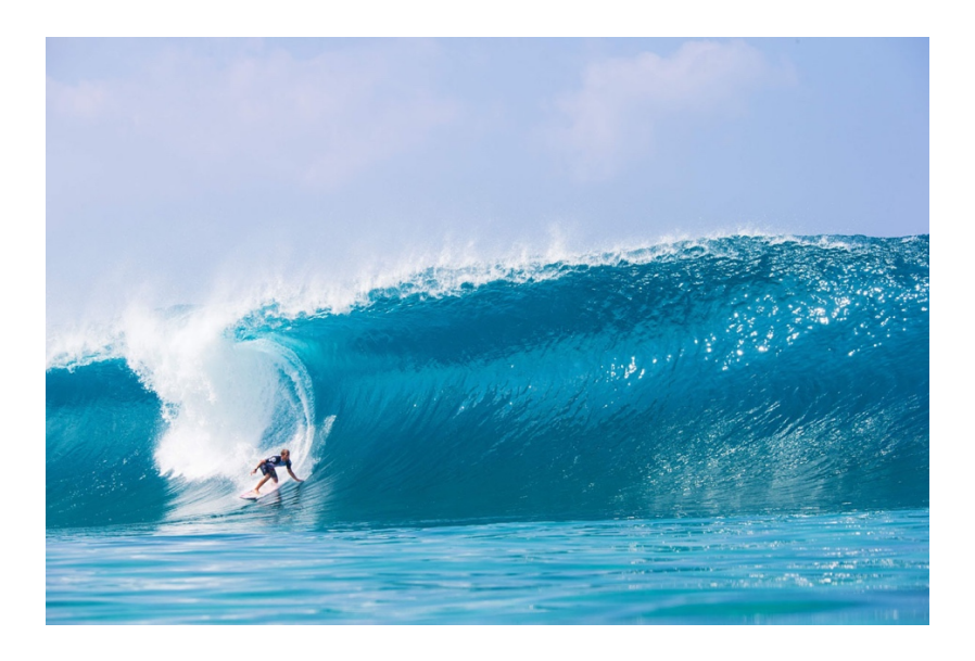
Winter surf at Pipeline, Oahu's North Shore

1. Rent a car and drive around the island counter-clockwise to the North Shore. 100 miles around. You follow the ocean much of the way, going past or through Laie, Chinaman's Hat, Pipeline, Sunset Beach, Waimea, Haleiwa. Stop at Dole Pineapple Plantation and walk through the world's biggest maze.