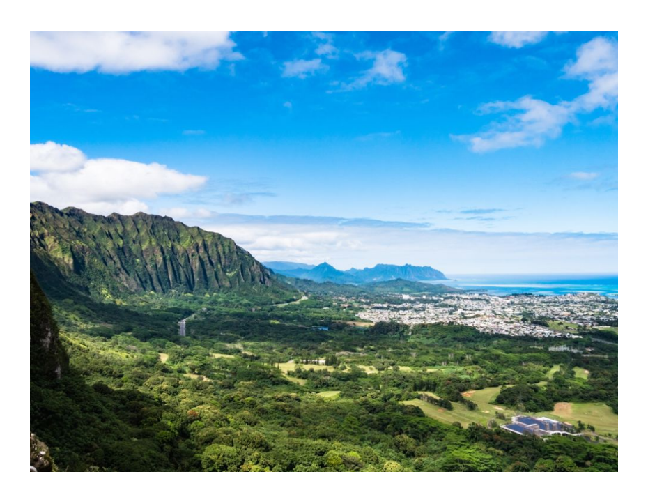
View from the Pali Lookout