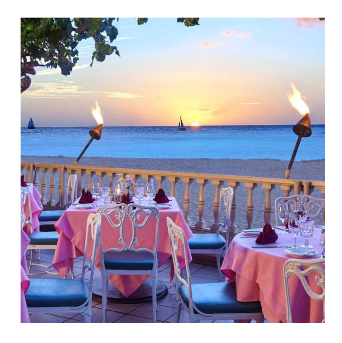
Dinner served inches from the beach at Hau Tree Lanai