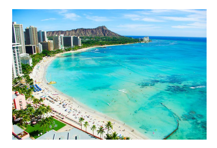
Waikiki Beach. Lotus Hotel is at top right.