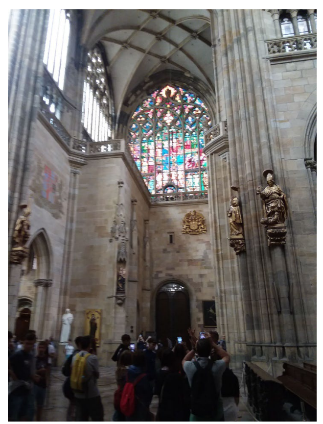
A Prague Castle Chapel